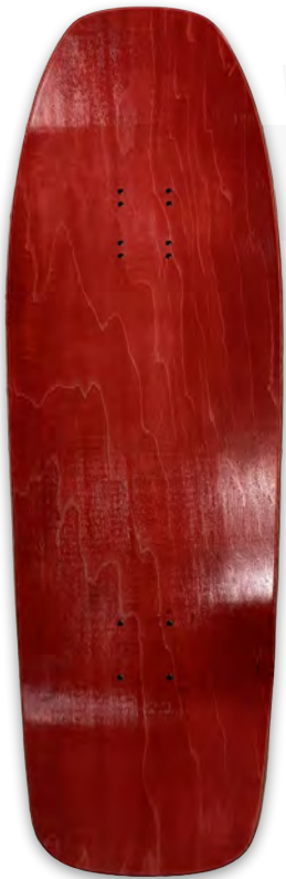
W11 - DOUBLE DRILLED 9.310" X 32.75" 14.75" OR 15.25" WB 6.8" TAIL 6.5" OR 7" NOSE

FUN SHAPES FOR TRANSITION, STREET, CURBS, SKATEPARKS, DIY ... OR WHATEVER TERRAIN YOU RIP!