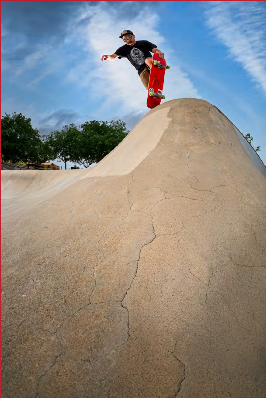
RUSTY HERNANDEZ, TAIL BLOCK ON THE J11 SHAPE