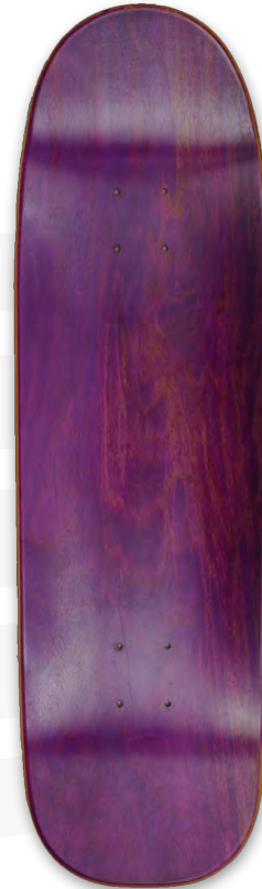
Z4 8.625" X 32" X 14" 7" X 6.75"