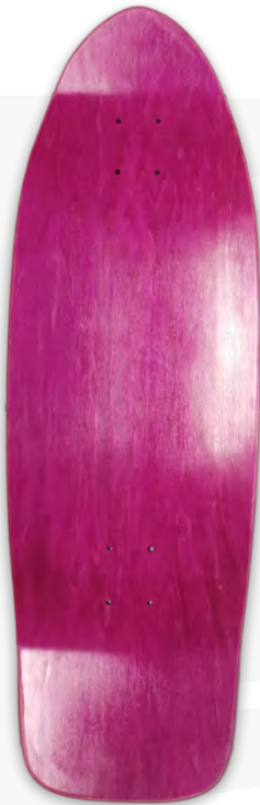
V11 PIG INFO COMING SOON