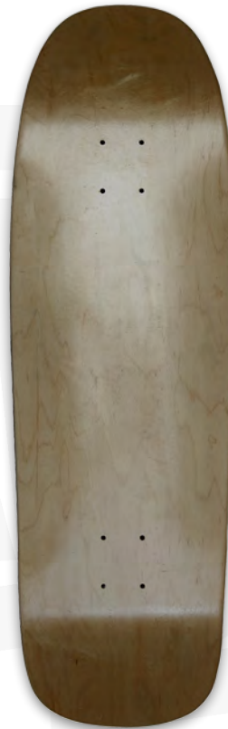
W7 9" X 33" X 15.25" 6.9" X 6.5"