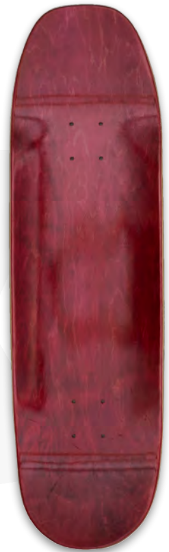
W8 8.5" X 32.25" X 14.75" 7" X 6.75"